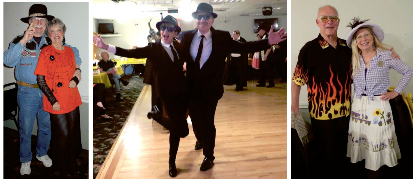
Thanks for getting in the spirit!