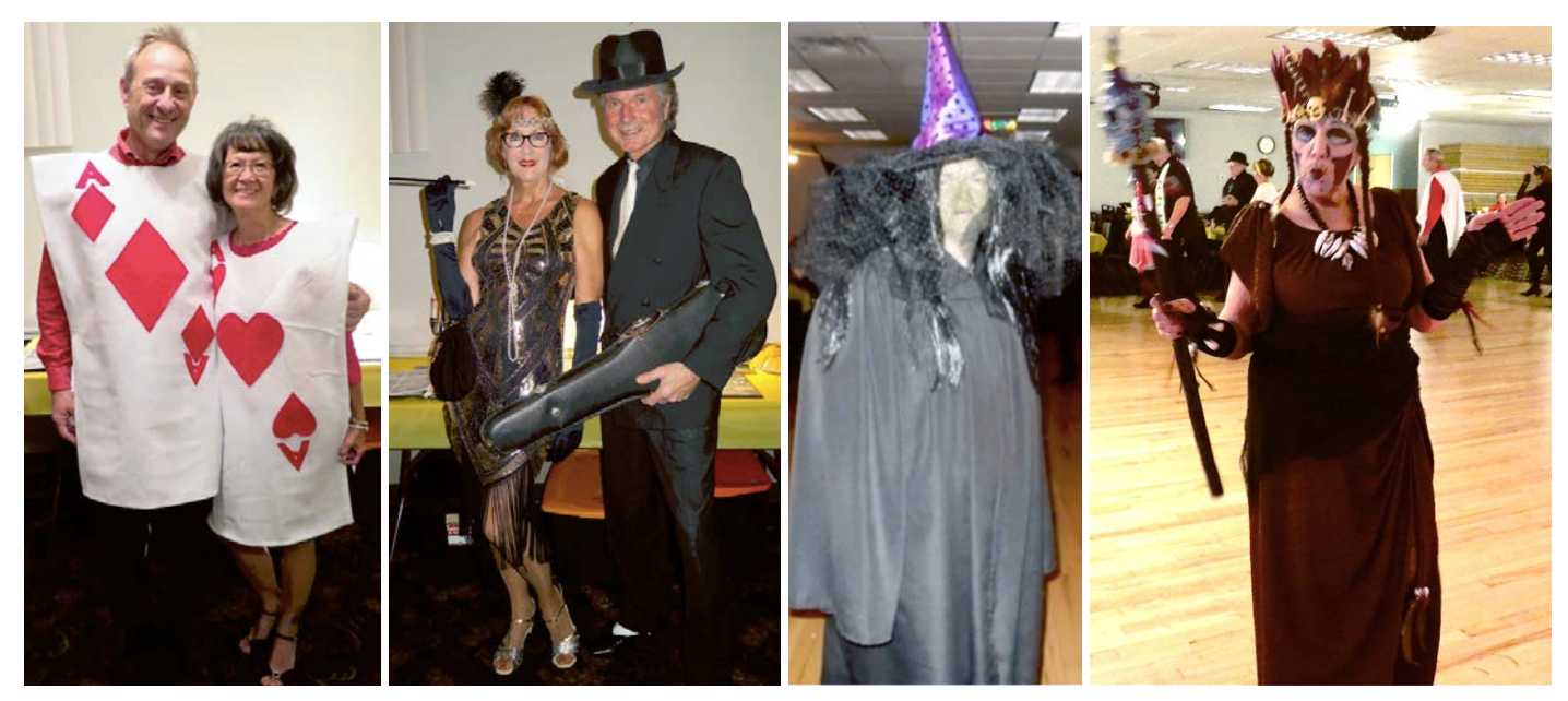
Chicago Jitterbug Club 2019 Halloween Dance Party